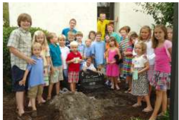
Children of the church help celebrate PVUMC's 50 th anniversary by participating in the time capsule burial on September 25